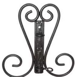
2 pcs – Holder