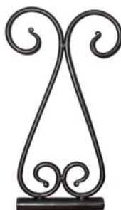
2 pcs – Hangrail Holder