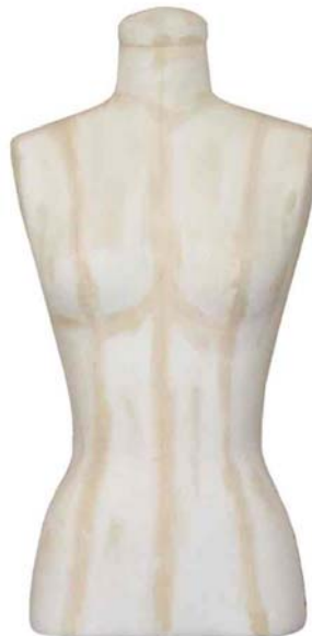
Antique Display Body Form